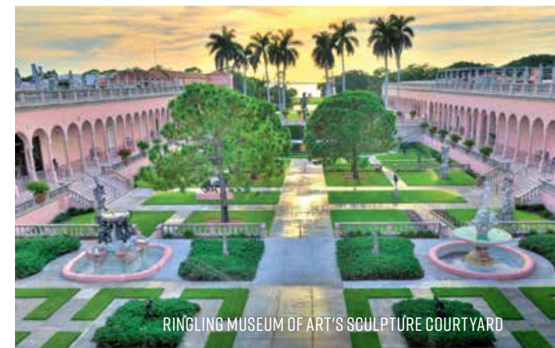
RINGLING MUSEUM OF ART'S SCULPTURE COURTYARD