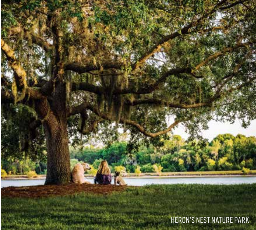
HERON'S NEST NATURE PARK