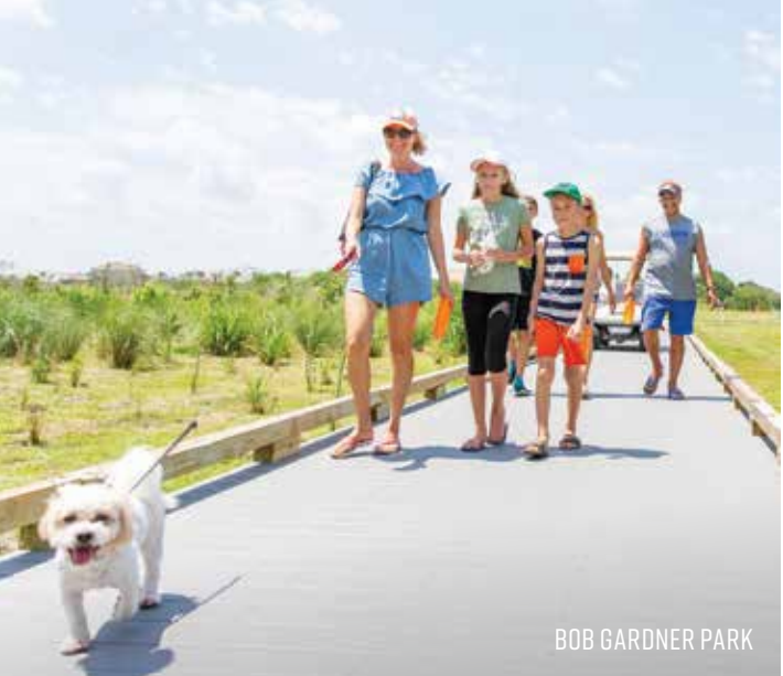
BOB GARDNER PARK